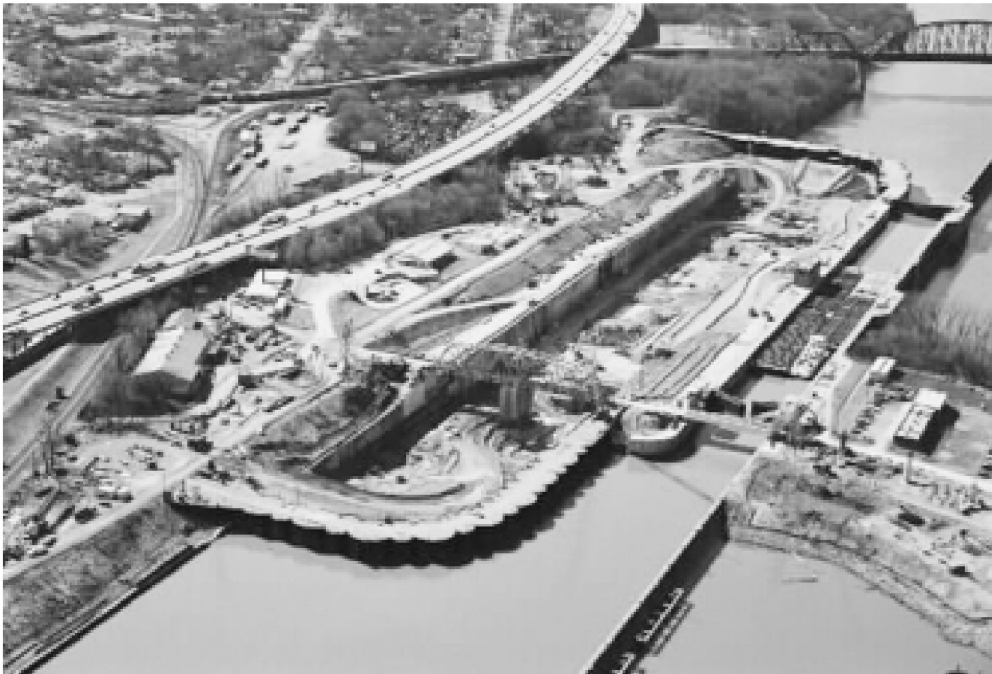
U.S. Army Corps of Engineers

Some auto facilities can produce the structural elements for this infrastructure, critically needed all over the upper Mississippi, Ohio, and Missouri River systems. Here, construction under way (on the Ohio at Louisville) of a modern, 1,200-foot lock chamber and gates (center) to replace the aged, undersized existing lock (right). U.S. Army Corps capacity and funding are lacking: This project was delayed so long, the old lock cracked and closed the river.