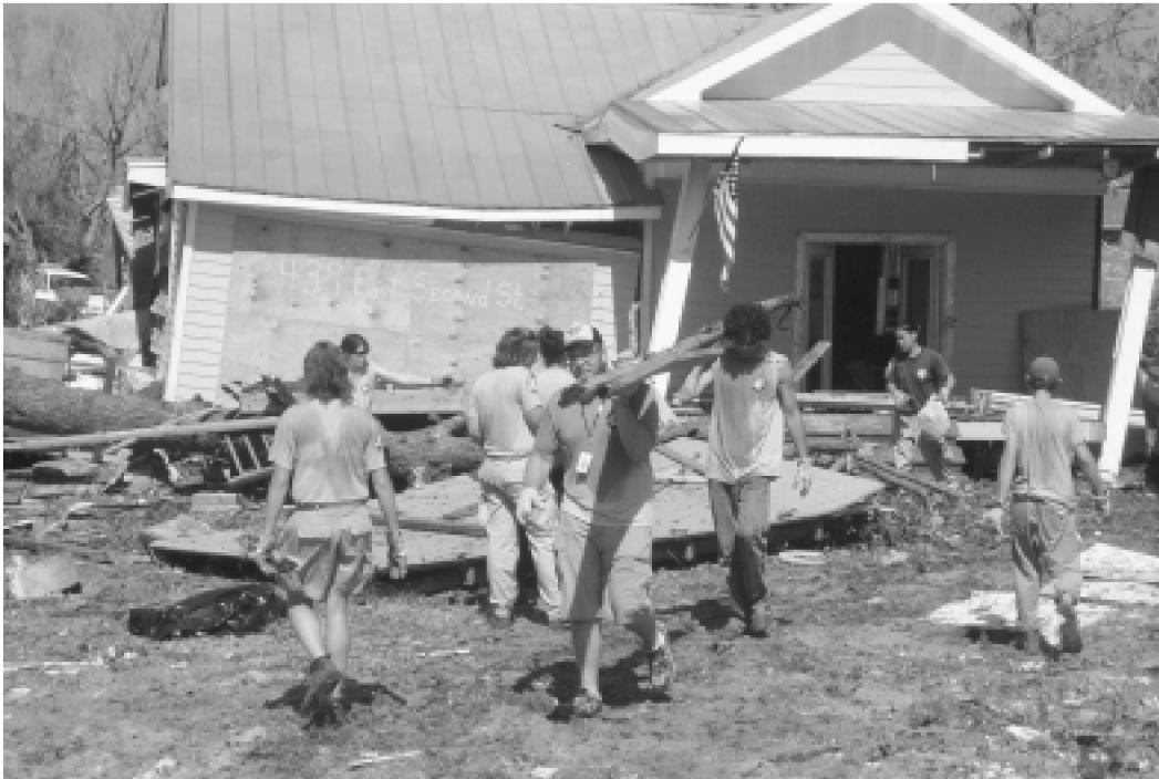
AmeriCorps members clear debris from a house in Pass Christian, Miss. in September 2005, following Hurricane Katrina. The AmeriCorps is not being used effectively, LaRouche said, but can be upgraded to undertake new missions, as we retool the auto industry.