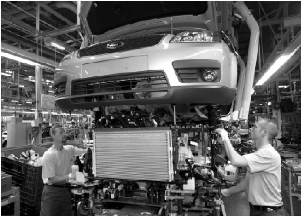
Ford Motor Co.

Production of the Ford Focus C-MAX in the plant at Saarlouis, Germany: LaRouche proposes that the U.S. and Germany “form a trans-Atlantic program of cooperation to save the potential in both countries, in the interests of both, and in the world at large.”