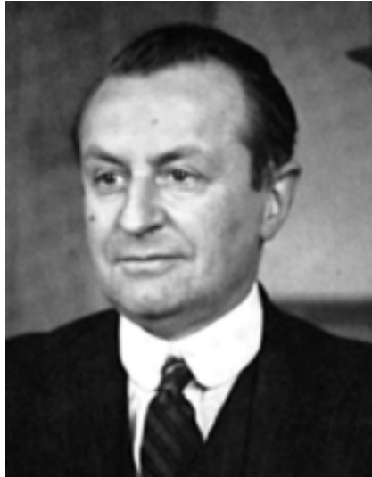
Soon after the Round Table Group was founded, leadership of the secret society to sustain the British Empire was turned over to Lord Milner (left) and Lord Lothian (Philip Kerr), along with Sir Robert Brand. Kerr later advocated appeasing Hitler, until 1939. From 1939-40, he was British Ambassador to the United States.

Brand and his two successors at Lazard holding positions on the Round Table’s secret committee, through into the 1980s at least.