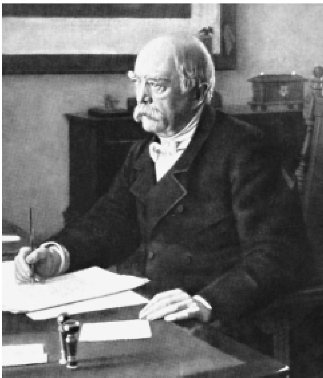
Germany's Otto von Bismarck. Engels' diatribe against Dühring was aimed at the latter's association with Bismarck's American-like economic reforms, as well as against American System economist Henry Carey's negotiations with Bismarck's advisors.

is the destiny implicit in the Anglo-Dutch Liberal geopolitical operations in the manipulation of the nations and ethnic and religious factions of the Southwest Asia cockpit of global asymmetric warfare today.