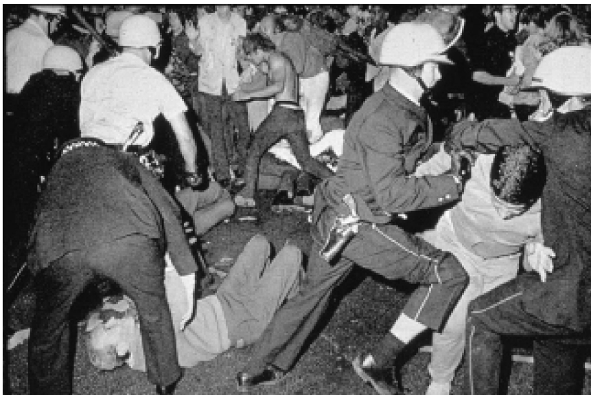
Jacobin anti-war protestors clash with police outside the 1968 Democratic Party convention in Chicago. The 68ers, LaRouche says, divided the Democratic Party, and turned it away from the FDR coalition of workers, farmers, and the poor.

who represent the white-collar culture, of the Baby-Boomer generation, which was built up by brainwashing of children, during the period of 1946 through 1956: Out of that, has come, now, a destruction of the United States and a fascist system.