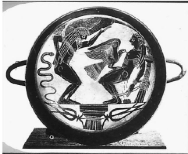
This Greek vase painting from around 500 B.C. depicts Prometheus (left) condemned by the Olympian Zeus to be bound on a desolate rock, where each day an eagle eats his liver. Prometheus' crime was to bring the gift of fire (and hence industry) to man, so that man would no longer be a slave. At right is Atlas, Prometheus' brother, who was also punished by Zeus, and condemned to hold up the sky.

Since the rise of what we recognize today as the ancient Greek civilization of about 700 B.C. and onward, European civilization, in particular, has been the victim of the vicious practices of what are known interchangeably as "imperial-