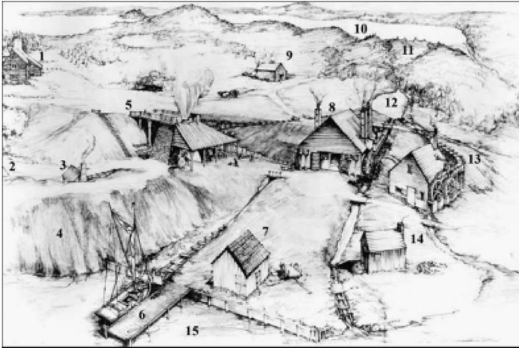
Saugus Iron Works National Historic Site

This drawing by Charles H. Overly, depicts the successful Massachusetts Bay Colony's Saugus Iron Works as it would have looked in 1650. Shown are the (1) Ironworks House, (2) Grist mill, (3) blacksmith forge, (4) slag pile, (5) blast furnace, (6) dock, (7) warehouse, (8) forge, (9) charcoal storage house, (10) Great Pond (main water supply), (11) canal to ironworks, (12) holding pond, (13) rolling and slitting mill, (14) blacksmith shop, and (15) Saugus River.