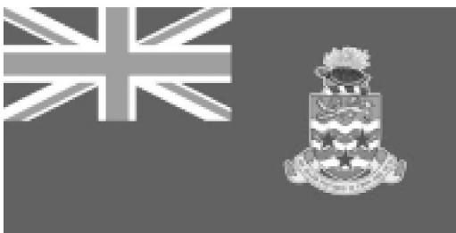
The flag of the Cayman Islands, home of the British monarch's hedge fund Draculas, which is "flying in to suck the juices out of our leading banks and crucially important industries here, today."