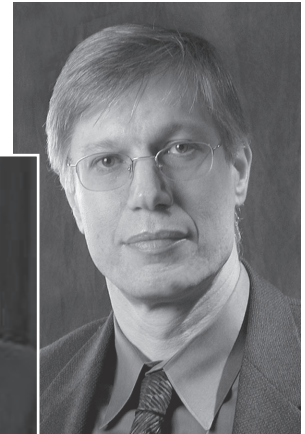
Ayn Rand Institute