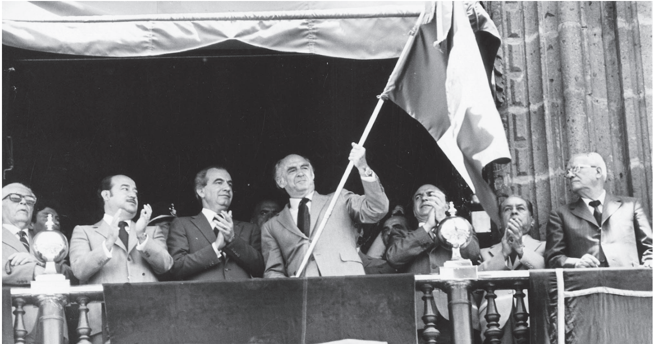
Government of Mexico

The late President José López Portillo raises the national flag in 1982, proclaiming the sovereignty of the republic and nationalizing the banks. Despite promises, he was not supported by the governments of Brazil and Argentina, and Mexico “went into the soup as a result of that.” He and LaRouche remained friends until López Portillo’s death in 2004.