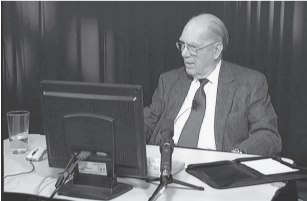
Lyndon H. LaRouche, Jr. addresses the webcast videoconference of Ibero-American activists. "We are in one of the most exciting and dangerous periods of modern history," he told them. "The present world monetary-financial system will inevitably disappear, soon. The question is, what will replace it?"