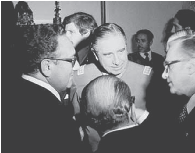
Henry Kissinger with the late Chilean dictator Gen. Augusto Pinochet. LaRouche describes how the two are linked to the BAE Systems super-scandal now breaking into the news, which demonstrates the British imperial grab for world power.

and it has not always operated that way, obviously—under our system, we generate credit through a vote in the Congress, especially the House of Representatives. The President of the United States then acts upon that authority of this Federal law, to utter currency as credit against the United States itself.