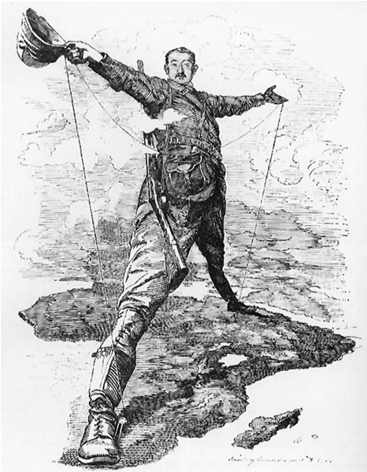
Cecil John Rhodes (1853-1902) founded the British Colony of Rhodesia (naming it after himself, of course). He used a private company to loot the nation.

So, when you talk today in terms of globalization, cartelization, and these companies having more power than governments, you're really talking about imperialism, and nothing modern, but something very, very old. And something outdated, I think, because I think the future lies in what Franklin Roosevelt was talking about, in terms of sovereign nation-states, and that is what Zimbabwe has attempted to do, in addressing one of the key issues the oligarchy has used to keep Africa in its sway, or under its power, which is the land issue. Who does the land belong to?