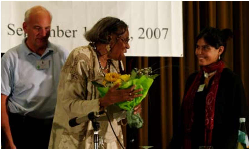
Amelia Boynton Robinson receives an ovation and flowers, after her speech to the conference. "I've been the happiest person in the world," she said, "because of having met the Schiller Institute ... and nobody can get me off the course, because I feel dedicated to these young people."

dignitaries were. And he accepted it. And his first suggestion was, "We are going to stay off this bus next week, beginning tomorrow, and during the week, we are going to stay off this bus."