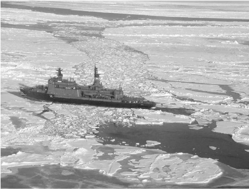
The Russians have some excellent, nuclear-powered ships, in the Arctic region, which means that the entirety of this region is now opened up for transportation, LaRouche pointed out. “It means that the whole region now is opened up as an area of development....”

Asia and Alaska, and development of a new rail system, modern rail system, is to unite these parts of the world which are among the great, important raw-materials areas of the world, for this kind of project.