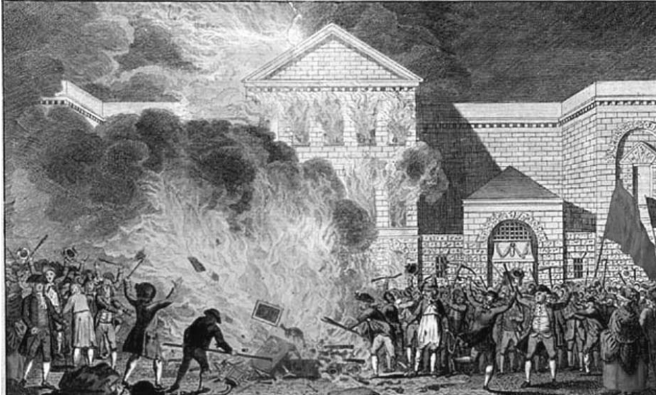
The burning of Newgate Prison in June 1780 was sparked by Lord George Gordon, Shelburne's agent provocateur. All the prisoners were freed, and joined in an assault on the Parliament building. A dress rehearsal for the storming of the Bastille in France nine years later?

of brethren, a share in a trade, the monopoly of which you sordidly preserved to yourselves. . . . Monopolies, some way or other, are very justly punished. They forbid rivalry, and rivalry is of the very essence of well-being of trade. . . . I avow that monopoly is always unwise; but if there is any nation under heaven which ought to be the first to reject monopoly, it is the English. Situated as we are between the old world and the new, and between southern and northern Europe, all we ought to covet on Earth is free trade. . . . With more industry, with more capital, with more enterprise than any trading nation on Earth, it ought to be our constant cry: Let every market be open."