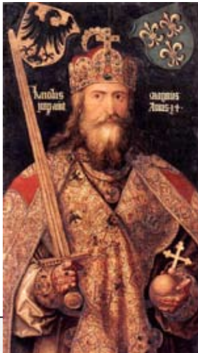
Charlemagne (742-814) developed a system of inland waterways, which had a sequel: the U.S. Transcontinental Railroad developed under Secretary of State John Quincy Adams. The idea was for the United States to become a continental nation, unified from Canada to Mexico, and from the Atlantic to the Pacific, and beyond. Portrait of Charlemagne by Albrecht Dürer (1513); Transcontinental Railroad completed in 1869, Promontory Summit, Utah; John Quincy Adams, President of the United States (1825-29).