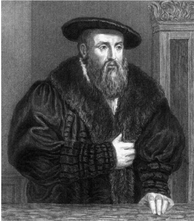
It was Kepler, and not the fraudster Newton, who made the uniquely original discovery of a universal physical principle of gravitation.

have no systematic involvement emotionally. For them, like Sophists generally, what they wish to be caught believing, praising, or deprecating, is the extent of their emotional engagement in the subject on which they express their “hand-waving” opinions. Like all Sophists, for them, truth is not the issue; being “accepted” by whatever circles by whom one wishes to be accepted, is everything. “MySpace mass-psychosis” is only an extreme expression of that misuse of emotions intended to evade the realities of either physical science, or almost anything else real in life’s experience.