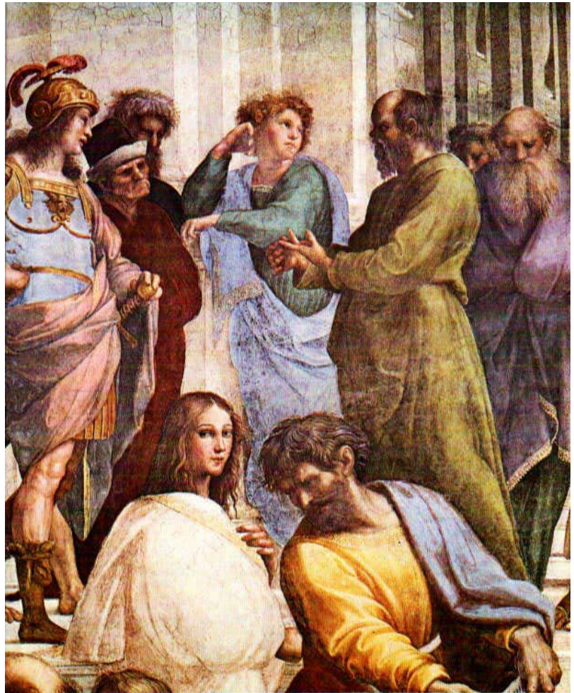
"Mankind is so gripped by their own fearful prescience of human mortality, that they do not even suspect the purpose in mortal life which they should be seeking." Raphael's "School of Athens" (1510), in the Vatican, portrays the principle of immortality. Shown: a detail, with Socrates (top row, second from right), in dialogue with other members of the Platonic Academy.

as if continued life of the soul might suggest the assembly of souls, from assorted past times, portrayed by Raphael Sanzio's The School of Athens .