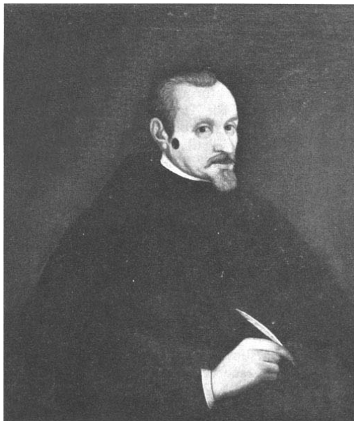
The new form of empire which emerged from the leadership of Venice’s Paolo Sarpi (above) spawned today’s Anglo-Dutch Liberal system, and unleashed the swarm of financiers at its core; the imperialist speculators in today’s petroleum “spot market” are the direct heirs of Sarpi’s model.

The new form of empire which emerged from the leadership of Paolo Sarpi, is what is called the Anglo-Dutch Liberal model. This Anglo-Dutch Liberal model is based on the ruling authority of an otherwise anarchic class of financiers in the tradition of Venetian usury, neo-Venetian usurers following the Liberal traditions of Sarpi. Sarpi launched that swarm of financiers who constitute the essential core of the imperial power of the present Anglo-Dutch Liberal imperialism nominally centered in London, as expressed typically in the imperial power of the post-1973 petroleum “spot market.”