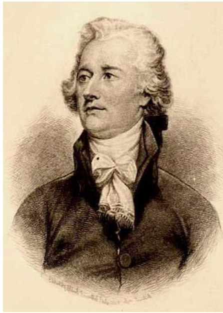
The U.S.A.’s first Treasury Secretary, Alexander Hamilton, was murdered by the British agent Aaron Burr, for his role in creating the “American System of political-economy.”

The habits associated with those assumptions and practice, “hedge-fund-like” stealing aside, have no functional correspondence to any useful, physical-economic function. However, because of the broad influence of the use of the special language of “economics” used as a rationale for the widespread practices and influence of the British empire, they have supplied many otherwise mutually differing bodies of opinion about economy, with what became a common special language of accounting for discussion among representatives of various proposed theories respecting human economic footprints. The consequent discussion proceeded without discovering the physical principle expressed by the actually walking man. Ordinary economists’ practice tells one of certain measurements and certain reportable conditions and events, but tells one virtually nothing of intrinsically physical-scientific interest about why an economy behaves as it does over the medium to short-term intervals, and, with some historical lim-