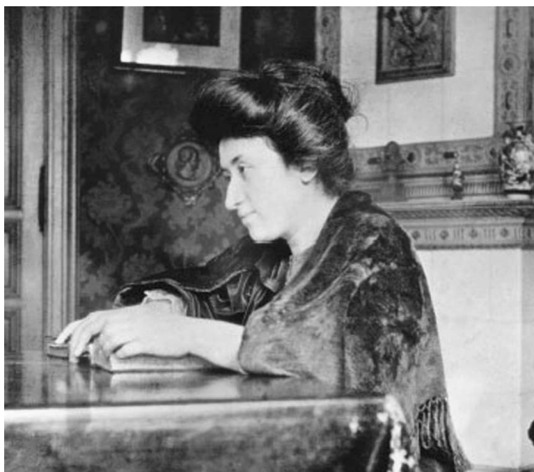
Rosa Luxemburg Foundation

The effect of the relevant, prevalent official delusion, on nearly all sides of decision-making, has been that the determined "market price" of goods has been driven far below the true physical cost of production by the relevant nation: a policy corresponding to what Soviet economist Evgeny Preobrazhensky of the 1920s called his proposed Soviet policy of "primitive socialist accumulation." Preobrazhensky, during his part in the Preobrazhensky-Bukharin debate of that time, was echoing the rather uniquely competent insight by econo-