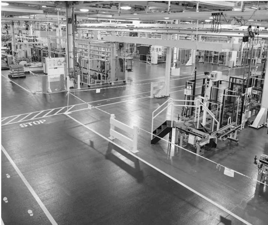
Ford Motor Co.

This Windsor, Ontario Ford engine assembly complex, with its modern production facilities, still employed 2,200 workers in 2006. It was shut down in the Fall of 2007, despite recent heavy capital investment, of hundreds of millions of dollars, into its machine-tool and flexible production capabilities.