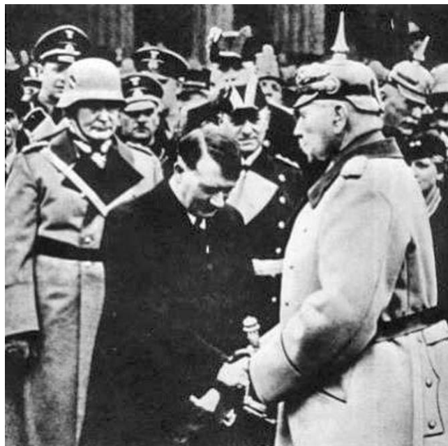
Following the Nazi Party's crushing defeat in the election of 1932, London-based financiers stepped in with the cash needed to put Hitler in the Chancellorship. Shown: President Hindenburg swearing in Hitler, Jan. 30, 1933.

The rise of Mussolini and Hitler has largely been falsely ascribed to the personalities of the two men, as a way of pretending that the National Fascist Party and the Nazi Party emerged spontaneously. The truth is that both Hitler and Mussolini were front-men for the oligarchy, whose financiers and psychological warfare units created, protected, and nurtured fascism. The bankers who supported Mussolini and Hitler did not do so because they were captivated by such men; they did so because they knew that Mussolini and Hitler were tools with which to destroy the nation-state. As La-Rouche aptly put it, just because you leave a poisonous spider in your neighbor's bed, does not mean you have an attraction to spiders!