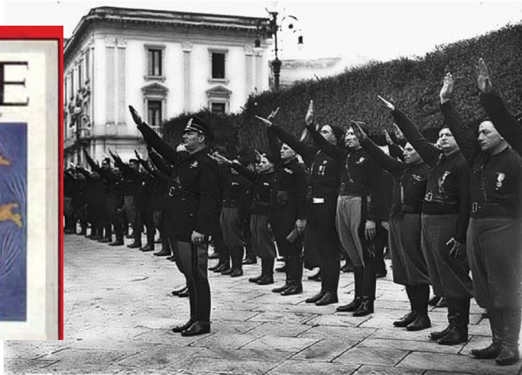
Behind Mussolini and his Fascist squadristi, shown here in Rome saluting Il Duce in March 1939, were the Venetian, London, and Wall Street bankers. Inset: Mussolini appeared on Time's cover eight times between 1923 and 1943; this cover is dated June 21, 1943.

world, retaining its close ties with J.S. Morgan (later Morgan, Grenfell).