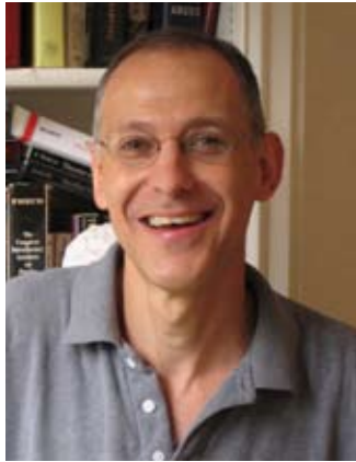
National Institutes of Health Dr. Ezekiel Emanuel

"At least 7 factors drive overuse [of medical care], 4 related to physicians and 3 related to patients. First, there is the matter of physician culture. Medical school education and postgraduate training emphasize thoroughness. When evaluating a patient, students, interns, and residents are trained to identify and praised for and graded on enumerating all possible diagnoses and tests that would confirm or exclude them. The thought is that the more thorough the eval-