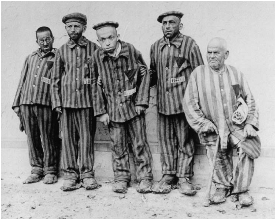
Like the Obama team, the Nazis used euphemisms in their infamous T4 program of “euthanasia,” which sent hundreds of thousands of German ill and aged to their deaths, under the rubric of a “merciful death” for those for whom treatment would be “ineffective” or “futile.” Shown: Jewish handicapped, victims of Nazi euthanasia.

“This transcript is evidence to present to a new Nuremberg Tribunal, should they succeed in carrying out their crimes against humanity. Here the criminals indict themselves, as if they were carrying out a secret conference of the inner cabal of the new Nazi regime. Now is when we must stop them, before the mass murderous ‘reform’ is put into place.”