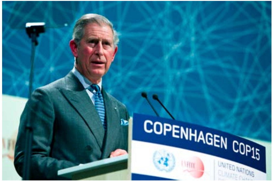
Ministry of Foreign Affairs of Denmark

EIR: What Mr. LaRouche always identifies is that