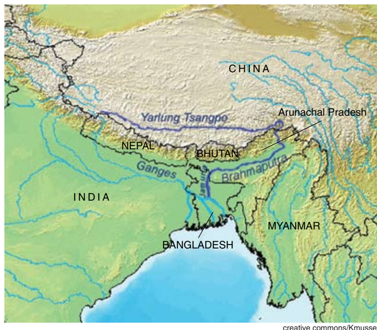
FIGURE 2 The Brahmaputra/Yarlung Tsangpo (Yarlu Zangbu) River system

Saudi-Pakistani ISI (Pakistan's intelligence service) financiers and protectors. Consider the reactions among the jihadis in Bangladesh against the proposed Tipaimukh Dam on the Barak River in the Indian state of Manipur bordering Myanmar. Former Bangladeshi Prime Minister and handmaiden of the Saudi-jihadi-ISI network, Begum Khaleda Zia, is now a drummer for the NGOs and environmentalist groups opposing the building of this dam.