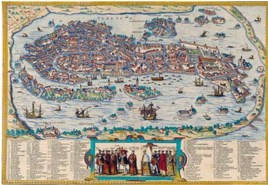
With the shift of power from the Mediterranean to the Atlantic, Venice remained the center of monetary power, while transferring some of its functions to London. Engraving of Venice by G. Braun and F. Hogenburg, 1565.

modern fascist notion of a “danger of over-population.”