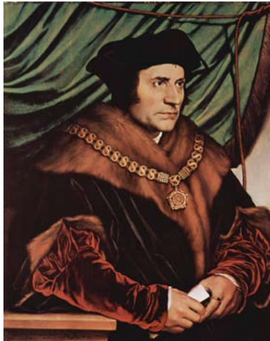
Henry VIII's judicial murder of Sir Thomas More (1478-1535) sealed England's commitment to perpetual warfare, which lasted until the 1648 Peace of Westphalia. Painting of More by Hans Holbein, 1527.

From the standpoint of the realities of physical production and consumption, there is no competent notion of economic value in a system of money as such, except for the practical role of the use of money as a politically controlled form of a system of monies of respectively sovereign nation-states. That arrangement, once it were installed by a leading group among consenting nations, would be a money-system to be used, on principle, as