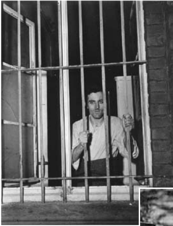
The predecessor of Obamacare: euthanasia in Nazi Germany (left). More than 10,000 people with disabilities were killed at Hadamar Hospital, shown here, in 1941.