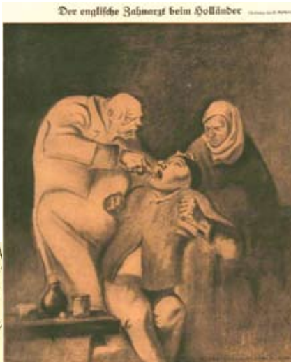
From the early-20th-century German magazine Simplicissimus : "The English dentist deals with the Dutch: 'I need your teeth to make myself a nice new set'" (left, 1918); drowning in a sea of cash (below, 1923, during the Weimar Republic's hyperinflation).

space-time within which a change of state of a social process, for either the better, or the worse, must be foreseen. For reasons which I have already presented, repeatedly, the personal, pathological traits of President Barack Obama would prevent him from abandoning those stubborn choices which would, themselves, ensure an early, chain-reaction collapse of the present world monetary-financial system. Notably, the presently "popular," but incompetent, customary methods of statistical forecasting, are predicated upon the presumptions of a Paolo Sarpian form of indifferentism, such as those of his follower Adam Smith, that in opposition to the existence of any actually efficient and knowable expressions of universal physical principles.