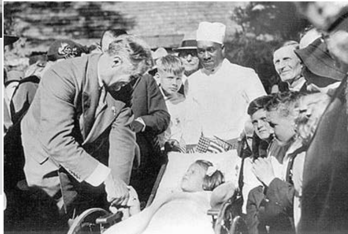
President Franklin D. Roosevelt's greeting to a young polio patient at Warm Springs, Ga. (right), expresses the American System approach to health care: Make them well, don't kill them off!

ified the same type of process, of moral decay mixed with physical bankruptcy of the society as a whole.