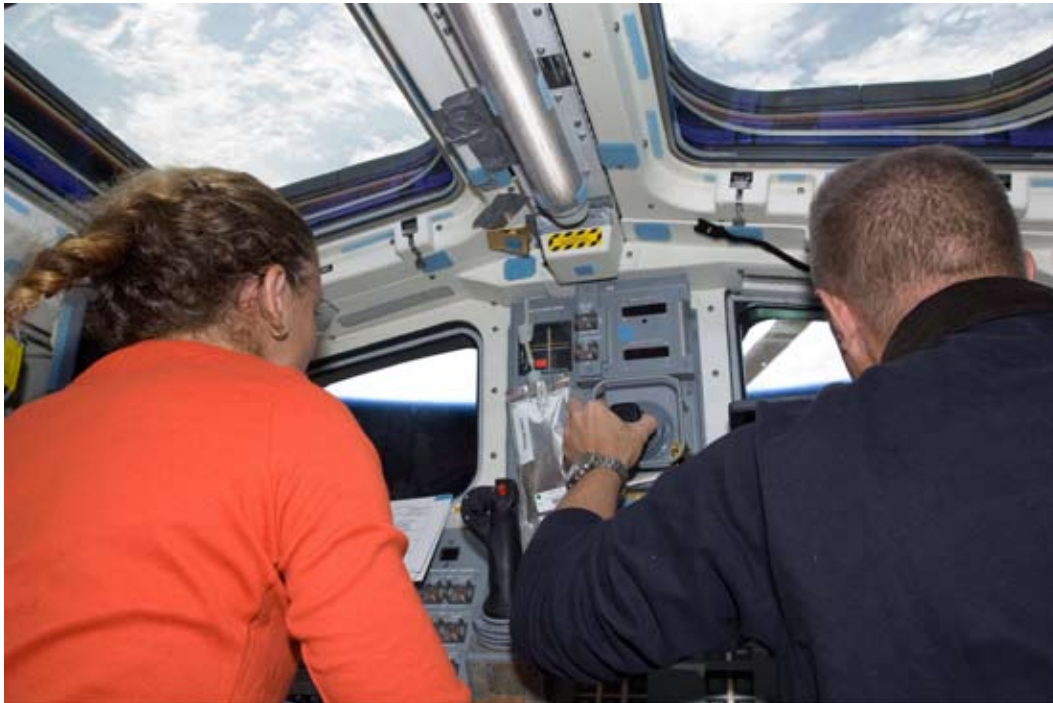
The commander of a space ship cannot rely on the essential unreality of sensual inputs concerning his or her surroundings, but must creatively use an array of even paradoxical inputs to find the way. Shown: astronaut Julie Payette and pilot Doug Hurley on the Space Shuttle Endeavor, July 29, 2009.