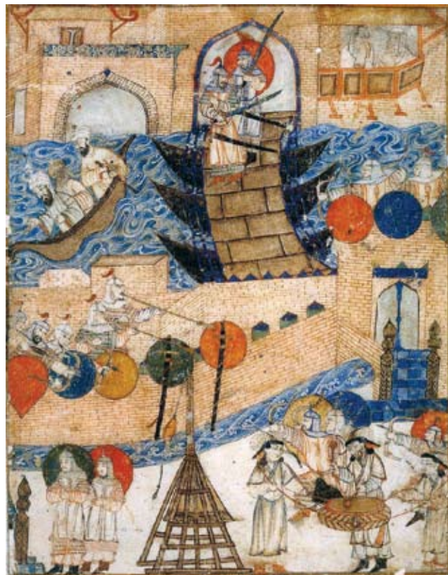
Mongol ruler Hulaku Khan’s army attacking Baghdad, the heart of the Abbasid Caliphate, in 1258 A.D. The city was completely destroyed, up to 1 million people killed, and the Golden Age of Islam brought to a close.

The intrinsically fraudulent, British “Malthusian” ideology expressed by Britain’s Prince Philip and his World Wildlife Fund, is essentially a product of the fear among ancient through modern oligarchies, that the general population of nations might become too intelli-