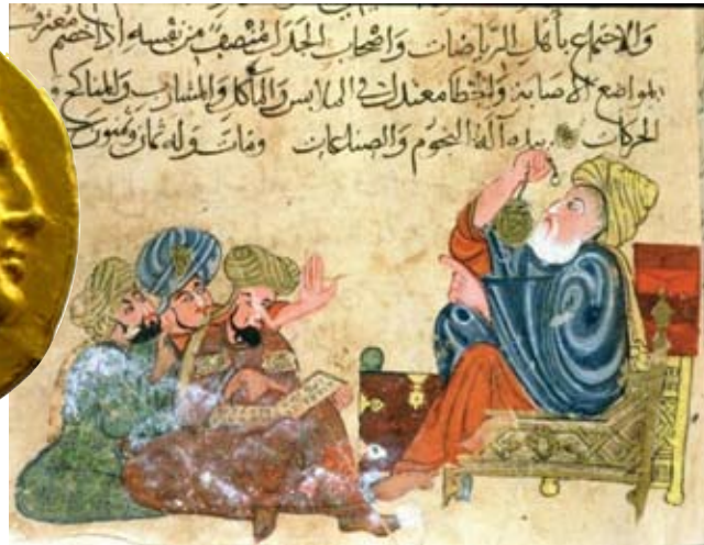
Topkapi Palace Museum