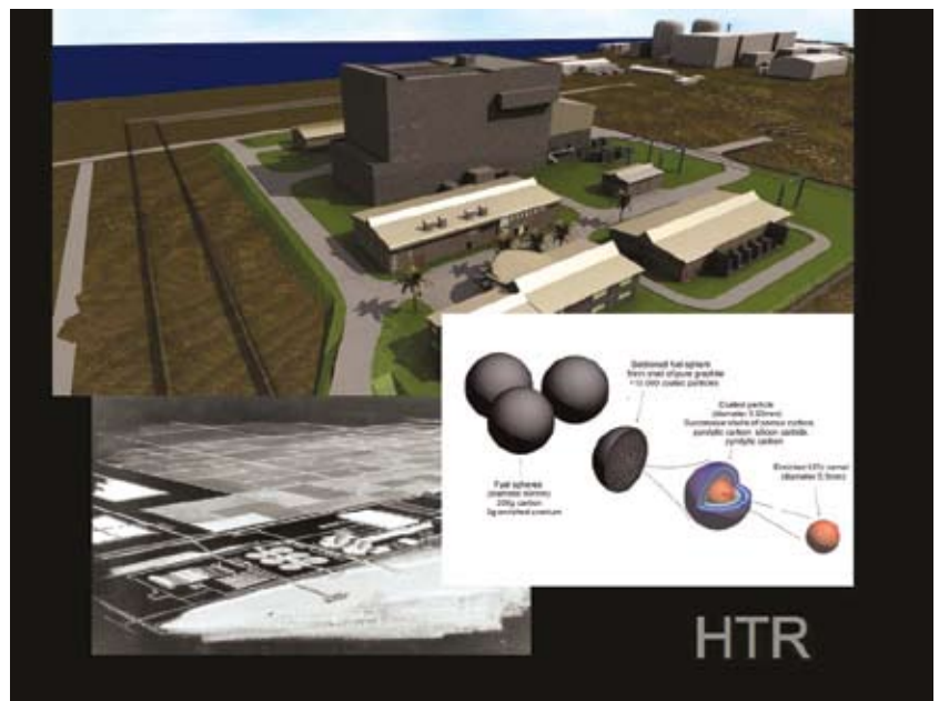
FIGURE 2 A Design for a High-Temperature Reactor

It is not the Africans who are to blame for the under-