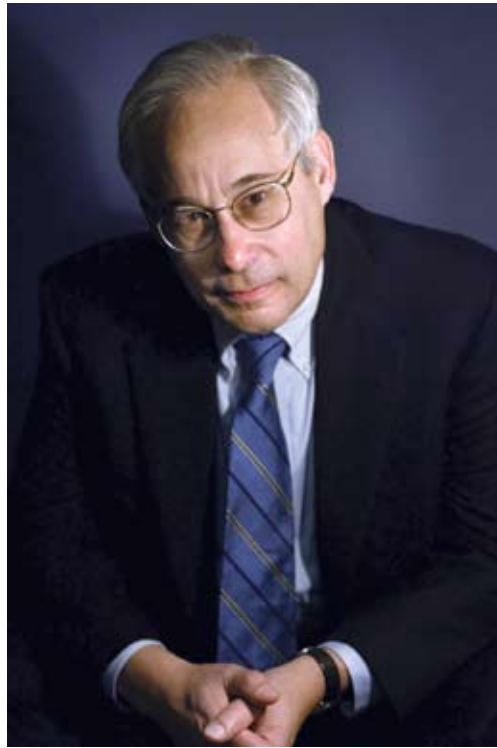
Institute for Healthcare Improvement

It is precisely those kinds of decisions which are today condemning all mankind to destruction.