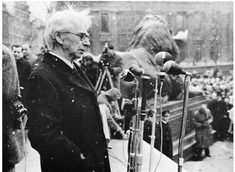
“Dirty Bertie” Russell viewed man as a beast, to be dominated by a ruling class, which, like the Olympian Zeus, would use technological power for control, while withholding the benefits of science and technology from mankind.

To compensate for the lack of productivity of its agriculture, the Roman Empire sought loot where it could steal it—especially by imposing enormous taxes. As the masses of impoverished farmers increased, they became easy prey for the northern German tribes (in some cases, even looked to them for liberation). The Empire collapsed—demographically, and eventually, politically. By A.D. 500, St. Ambrose was writing of the “corpses of half-ruined cities” in Italy’s once-fertile Po Valley. The anti-technology, as well as pro-war policies