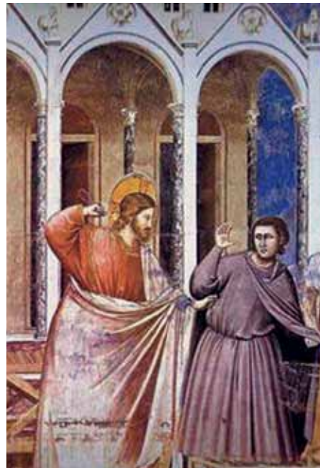
"Jesus Driving the Moneychangers from the Temple" (detail), Giotto, Scrovengi Chapel, Padua, 1304-06.

ers from the Temple" (Figure 4), Jesus comes alive. And yet, Giotto's rendition of his face is faithful to tradition.