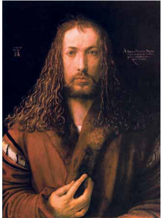
“Self-Portrait (as Christ),” Albrecht Dürer, 1500.

Dürer/Christ bears a strong resemblance to the earliest images.