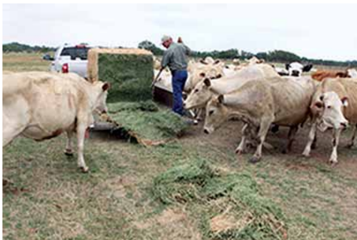
American Farm Bureau Federation, Texas

In Mexico, hunger is widespread and getting worse. There are 20 million, out of 113 million total, going hungry as of late 2010, according to a new report this month. This is up by 2 million since 2008. The survey of “food poverty” estimates that 25% of the population does not have secure access to basic food. The National Institute for Nutrition estimates that 20% of Mexican children are suffering actual malnutrition. The Institute registered a daily count of 729,000 children under the age of five, as being malnourished, in mid-October.