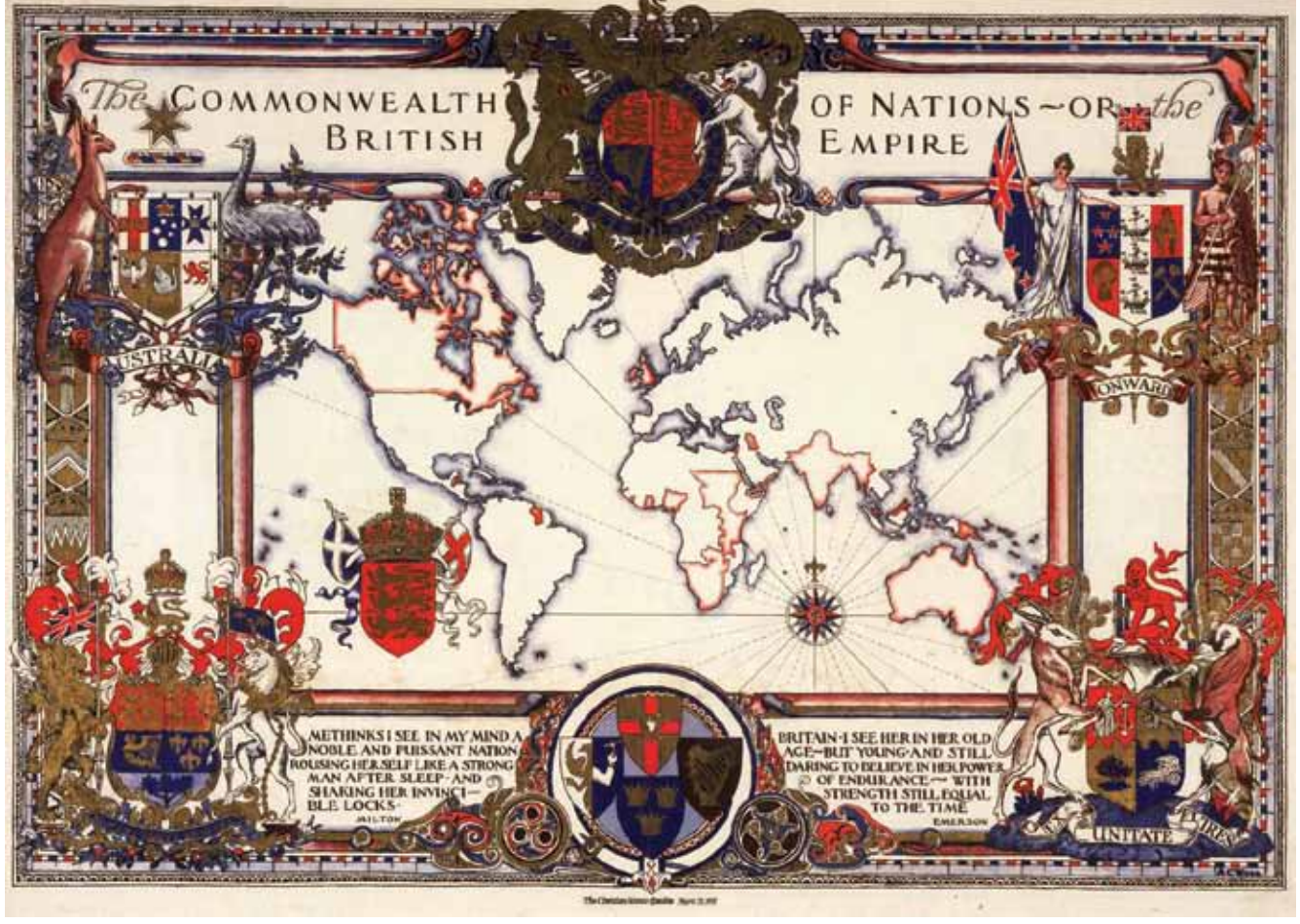
The British Empire in 1937 (orange borders). "The oligarchical system," writes LaRouche, "has been a dominant expression of a tyranny over most of the past, and still present parts of the history of mankind, over mankind as a whole still today."

ruling social stratum. Take the case of the British oligarchy for example; reflect on the following evidence.