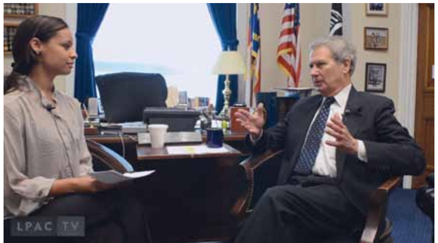
Rep. Walter Jones, shown here in an interview with LPAC-TV's Ardena Jones (no relation), in October 2011, has introduced a resolution that puts President Obama on notice that he may be subject to impeachment.

The text (see box) is simple and direct: “ Resolved by the House of Representatives (the Senate concurring), That it is the sense of Congress that, except in response to an actual or imminent attack against the territory of the United States, the use of offensive military force by a President without prior and clear authorization of an Act of Congress violates Congress’s exclusive power to declare war under Article I, Section 8, Clause 11 of the Constitution and therefore constitutes an impeachable high crime and misdemeanor under Article II, Section 4 of the Constitution. ”