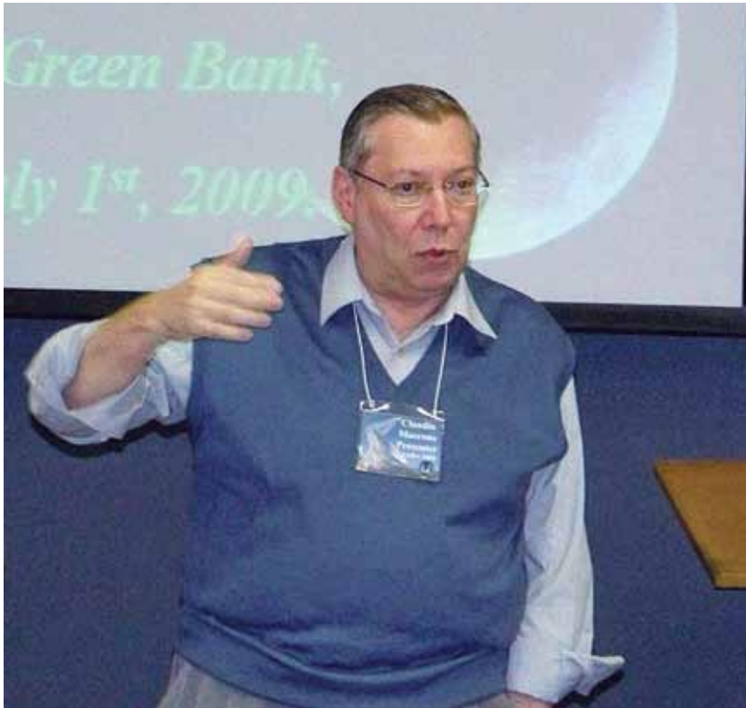
U.S. Department of Energy