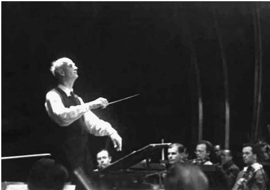
Wilhelm Furtwängler's performance of musical composition provides "an actually human experience of the future as acting on the present," in which "we 'hear' a foretaste of what is yet to be actually heard." Shown: Furtwängler conducts the Vienna Philharmonic Orchestra performing Schubert, in January 1951.

eral, and of the principle which the practice of Furtwängler's discoveries helps us to be enabled to convey, still today.