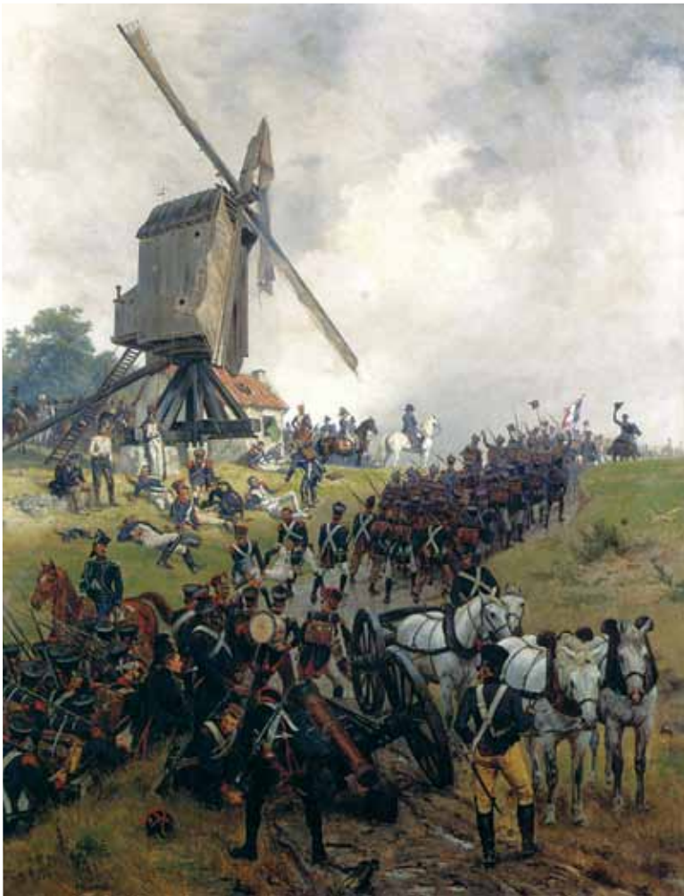
The British Empire, based on the East India Company, “was led through the London-directed French Revolution’s Terror, and through the Napoleon Bonaparte whose just defeat had led into a massive set-back for modern science throughout Europe.” Shown: “The Battle of Waterloo,” by Ernest Crofts (ca.1900). Napoleon can be seen on a white horse at the center of the painting.

Terror, and through the Napoleon Bonaparte whose just defeat had led into a massive set-back for modern science throughout Europe. The dregs of the earlier phase of the system of the New Venetian Party tyranny which had been that of William of Orange, were transformed, step by step, into a monetarism-dominated imperial echo and heir of the original Roman Empire.