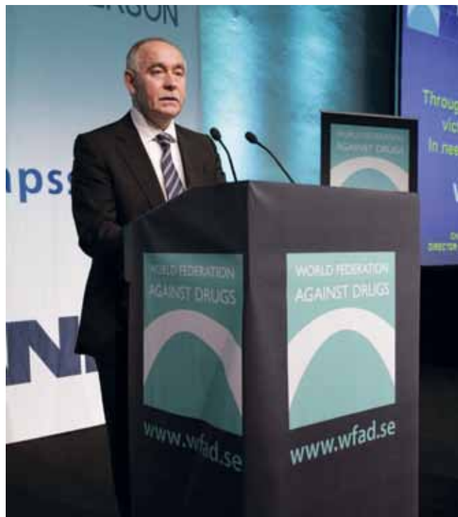
WFAD Russia’s anti-drug chief Victor Ivanov addresses the 3rd World Federation Against Drugs conference in Stockholm, May 2012. He roundly denounced the advocates of drug legalization.

A particular focus is Afghanistan, where drug-production and -trafficking has soared since the NATO-U.S. invasion began in 2001. Russia is now the world’s largest consumer of Afghan heroin, so stopping this