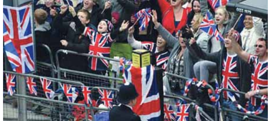
The oligarchical principle: “The nominally ‘lower social classes’ are organized as subjects of the intentions which the ostensible upper class imposes as the conditioned ‘desires’ induced among the lower.” Here, the royal wedding of Prince William and Kate Middleton, observed by Her Majesty Queen Elizabeth II, and adoring crowds, April 29, 2011.

ently in the British imperial monarchy itself.