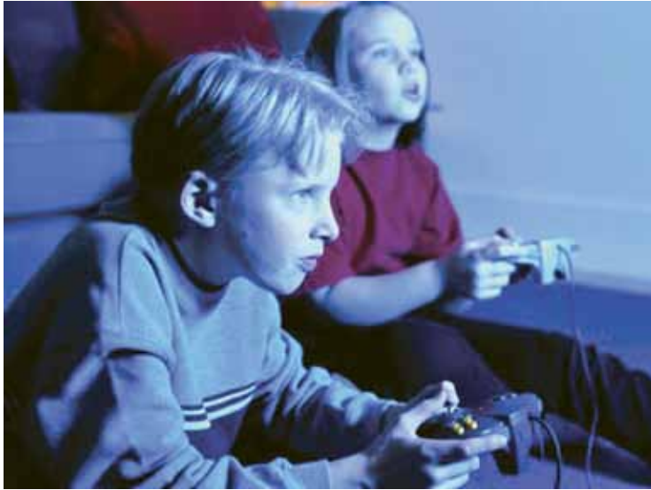
The customary rearing of children and adolescents tends to “crush out of existence” their noëtic potentials, the quality of “future-insight.” Here, children play mind-destroying video games.

result of crushing the noëtic potentials of the majority among children and adolescents early on. I strongly suspect the latter to be the case in point. I do know that presently customary rearing of children and adolescents, as I have observed it, tends to virtually “crush out of existence” the specific quality of future-insight which is relevant for this case. In my direct experience in such matters, parental households and schools are certainly largely to blame for contributing to the losses of the relevant qualities of foresight.