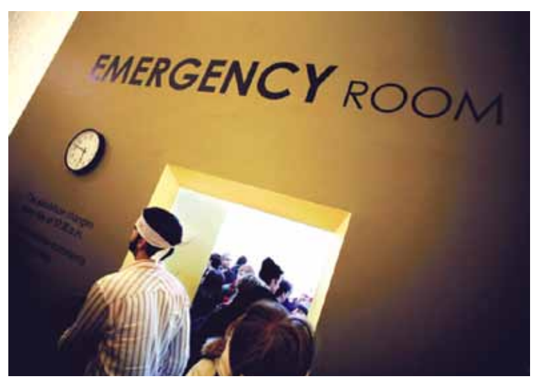
Creative Commons/Thierry Geoffroy