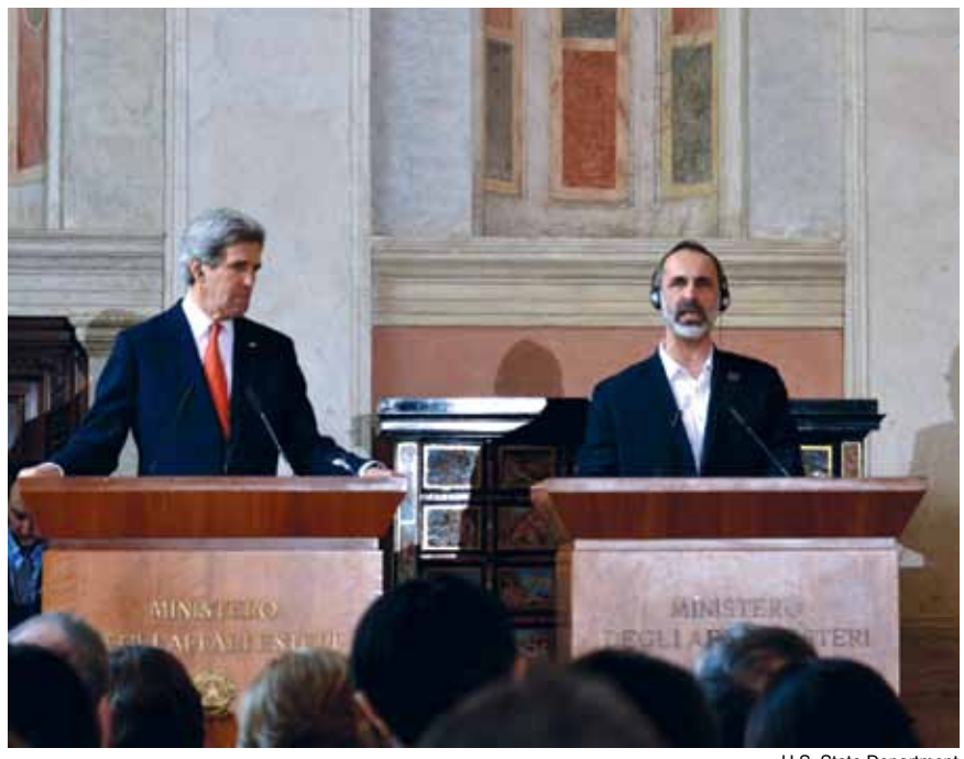
U.S. State Department