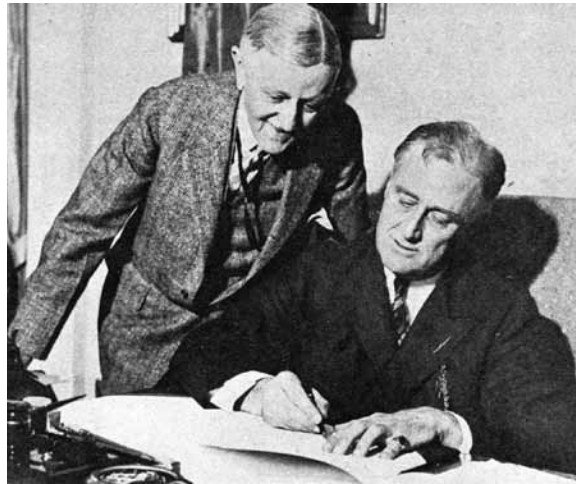
The Emergency Banking Act was the first measure of the Hundred Days, pushed through on March 9, 1933. President Roosevelt is shown in this photo signing the bill, as Treasury Secretary Woodin looks on.

Recruitment centers were set up by the Department of Labor, and, in coordination with the Departments of the Army, Agriculture, and the Interior, the enrollees were