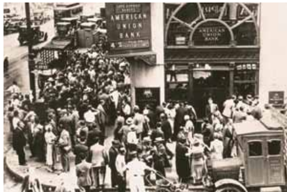
Bank runs were taking place around the country, as FDR took office. Here, depositors line up at the American Union Bank in New York City, following the 1929 Crash.