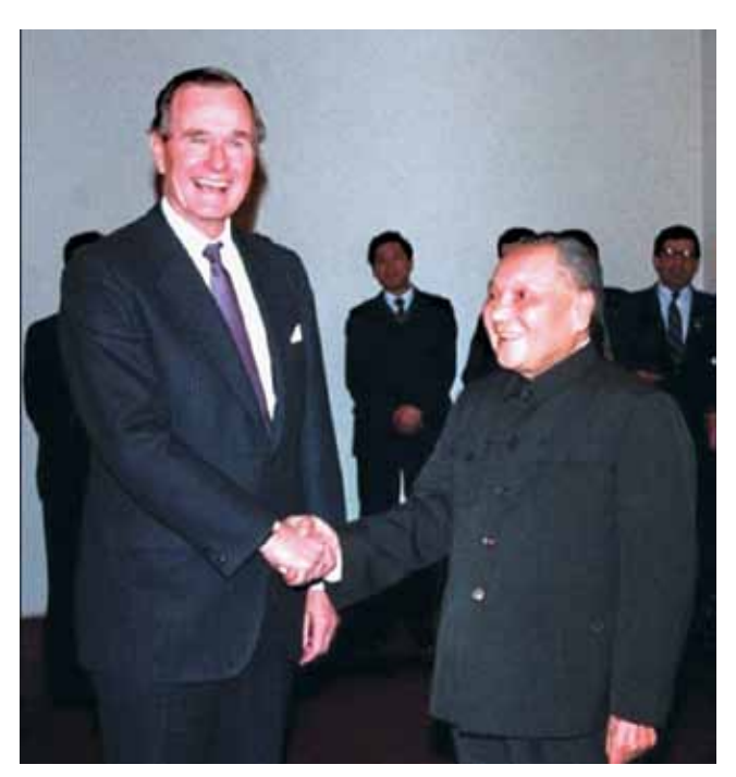
President George Herbert Walker Bush (son of Prescott) carried on the eugenicist policy of his forebears, advising the Chinese leader Deng Xiaoping (right) to sterilize the population.

"[But the] most disturbing aspect of the abortion issue that was brought before the Task Force, is the disparity between the availability of professional abortion services to those women who can afford the $500-$700 to obtain a therapeutic abortion and the estimated one million illegitimate abortions performed by the unlicensed practitioners for those women who cannot