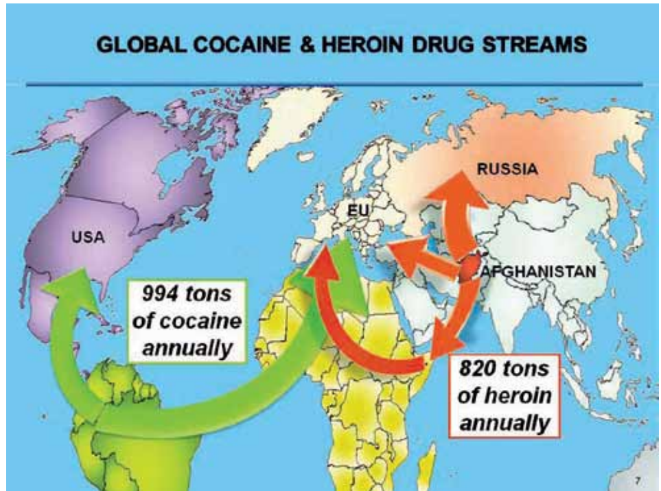
Victor Ivanov, the director of the Federal Drug Control Service of the Russian Federation, used this map in a speech in Washington on Nov. 18, 2011.

The large-scale withdrawal of the international forces (ISAF) in Afghanistan will mean, in addition to the loss of control over several areas (provinces), an increase in opium poppy cultivation, drug production, and trafficking. The troop withdrawals themselves, with the accompanying increase in the transit of military equipment and troops, will also mean an additional margin of growth of drug trafficking. This might involve private initiatives by individual soldiers, who would view a certain amount of drugs they take home with them as “severance pay”; the drugs could be sold for cash. Also, organized groups of corrupt soldiers who have gotten into larger-scale drug trafficking, thus undercutting the interests of their military service and