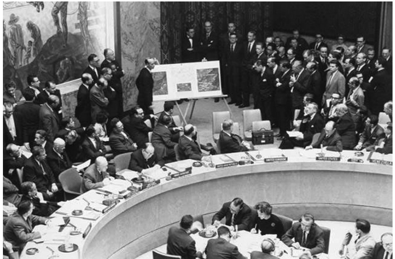
During the Cuban Missile Crisis of 1962, U.S. Ambassador to the United Nations Adlai Stevenson shows the Security Council aerial photos of Soviet nuclear weapons. A recent Voice of Russia radio broadcast warned that we are closer to nuclear war now than we were then.