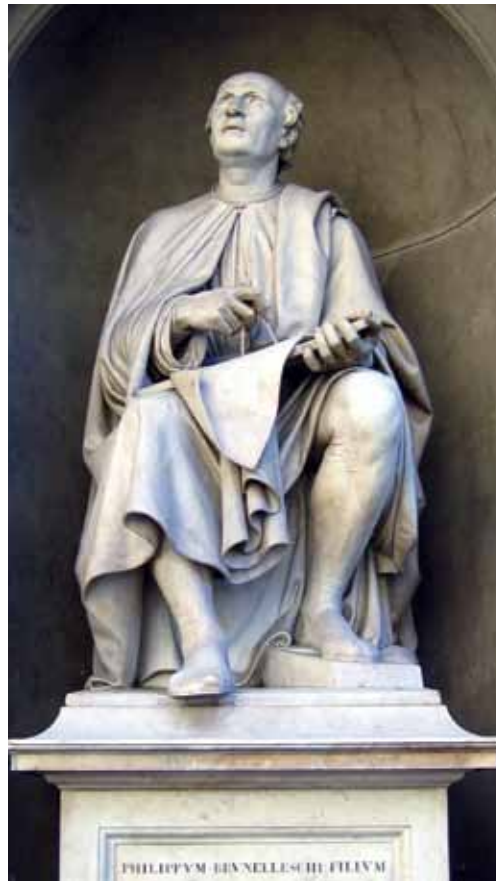
"All modern science of any competence, depended upon two great figures of the Renaissance period, Cusa and Brunelleschi, the older figure, who invented physics! He built a great cathedral; it was the first miracle of this type ever created." This statue shows Filippo Brunelleschi (1377-1446) looking upward at his beautiful creation, the dome on the Cathedral of Florence.

But the human body has two crucial points. One is the human brain; the other is the human mind. The human mind is the product of the noëtic process operating on the brain. So therefore, when you die, if you're a scientist, you're dead. You're silenced, your body no longer functions, it goes away, disappears. But then, when you look at the case of Max Planck, or Albert Ein-