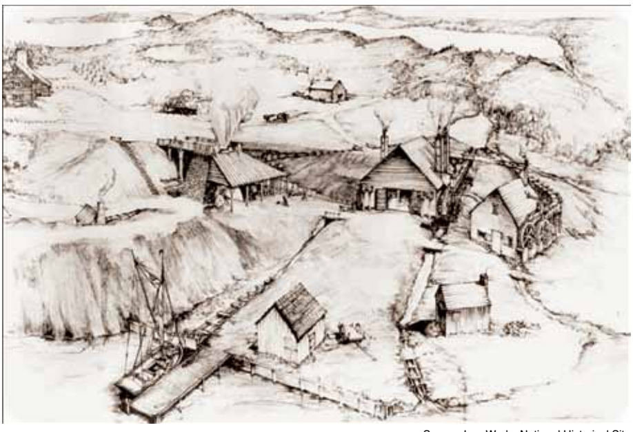
Saugus Iron Works National Historical Site

A similar set of relationships exists for mankind's true discoveries of principle. From this, we can adduce a general principle of physical energy-flux density. Truth becomes clear, when we take into account the Classical poetry and related means of an actually Classical type of truly humanistic energy-flux density, such as the example of Filippo Brunelleschi's artistic composition of physical principles, and that like in the unique notion of design of the principles of "hanging ropes" (and the like) for the dome of Santa Maria del Fiore of Florence and the musically (physi-