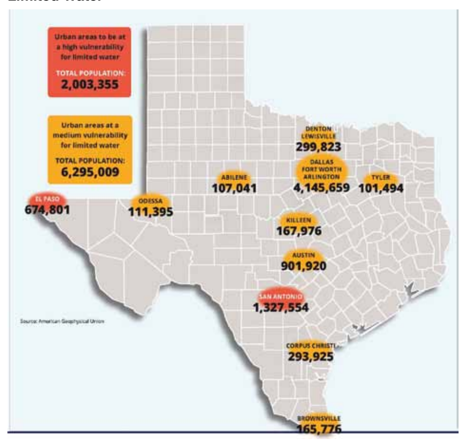
FIGURE 1 Short on Supply: Urban Areas at Medium or High Vulnerability for Limited Water

American Geophysical Union; Texas Water Report, January 2014