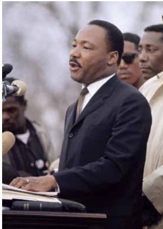
Martin Luther King, Jr., the year before his assassination on April 4, 1968, gave a speech in Atlanta, in which he made clear that he was prepared to give his life in the fight for justice, and by doing that, he became immortal.

“You may be 38 years old, as I happen to be. And one day some great opportunity stands before you and calls you to stand up for some great principle, some great issue, some great cause. And you refuse to do it,