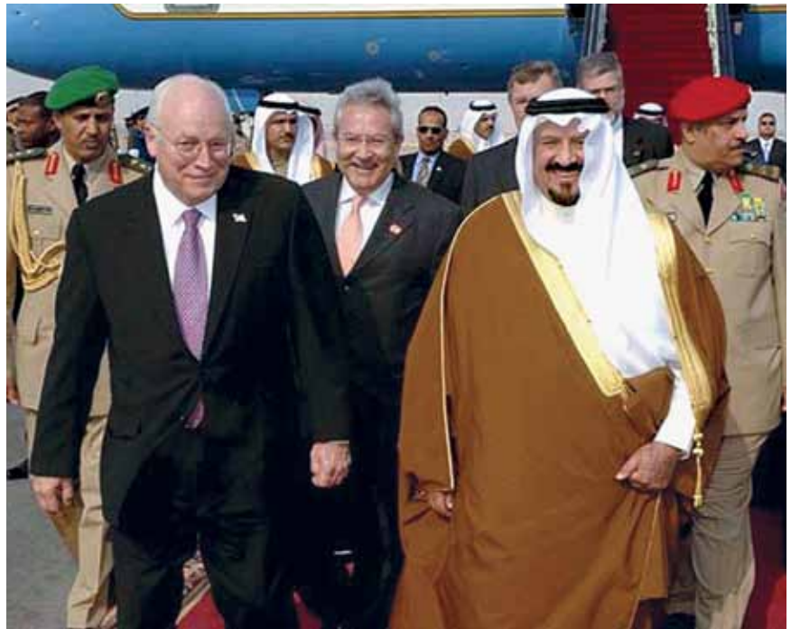
Cheney was in on the 9/11 attacks on the United States, which were orchestrated by members of the Saudi royal family, whose role continues to be covered up by the Obama Administration. Here, Cheney with friends in Saudi Arabia, 2006.

The time has come when we must throw Obama out of office for crimes he has committed. And most of his administration has been a criminal one that involves violations of the Constitution, of which this case is one. His complicity with Cheney in this operation is one of the operations which has sunk the United States so far. And therefore, to maintain this man and his crew in office, to me, is tantamount to treason against the United States.