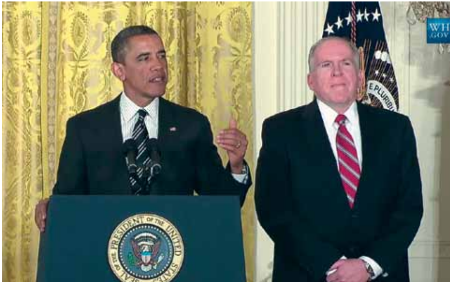
White House video

President Obama and his CIA Director John Brennan are continuing the crimes of the Bush-Cheney regime; they have blocked release of 9,000 White House documents demanded by Congress on Cheney's torture and renditions program.