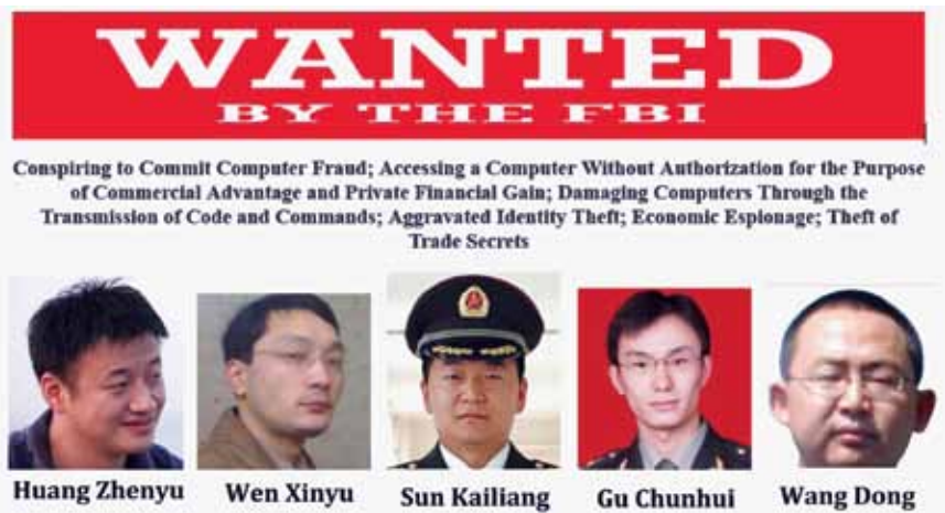
A new escalation against China from the Obama Administration: the indictment of five Chinese military officers on "cyber-warfare" charges. Beijing did not miss the irony, given the NSA's history of worldwide cyber-espionage.

The relations between Taipei and Beijing have improved under Taiwan's current Guomindang government of Ma Ying-Jeou, but in March a student movement backed by the greenie opposition Democratic Progressive Party and the U.S. NGO-controller and re-