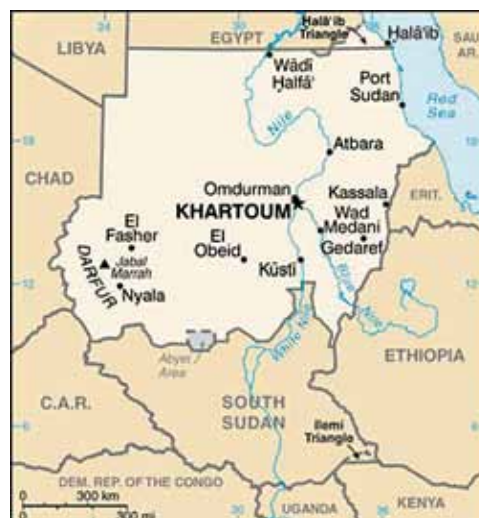
FIGURE 1 Sudan

According to the Convention on the Prevention and Punishment of the Crime of Genocide adopted by UN General Assembly in 1948, genocide is defined as “any of the following acts committed with intent to destroy, in whole or in part, a national, ethnical, racial or religious group as such: