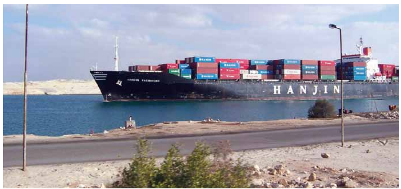
Wikimedia Cpommons?Danliel Csorfoly