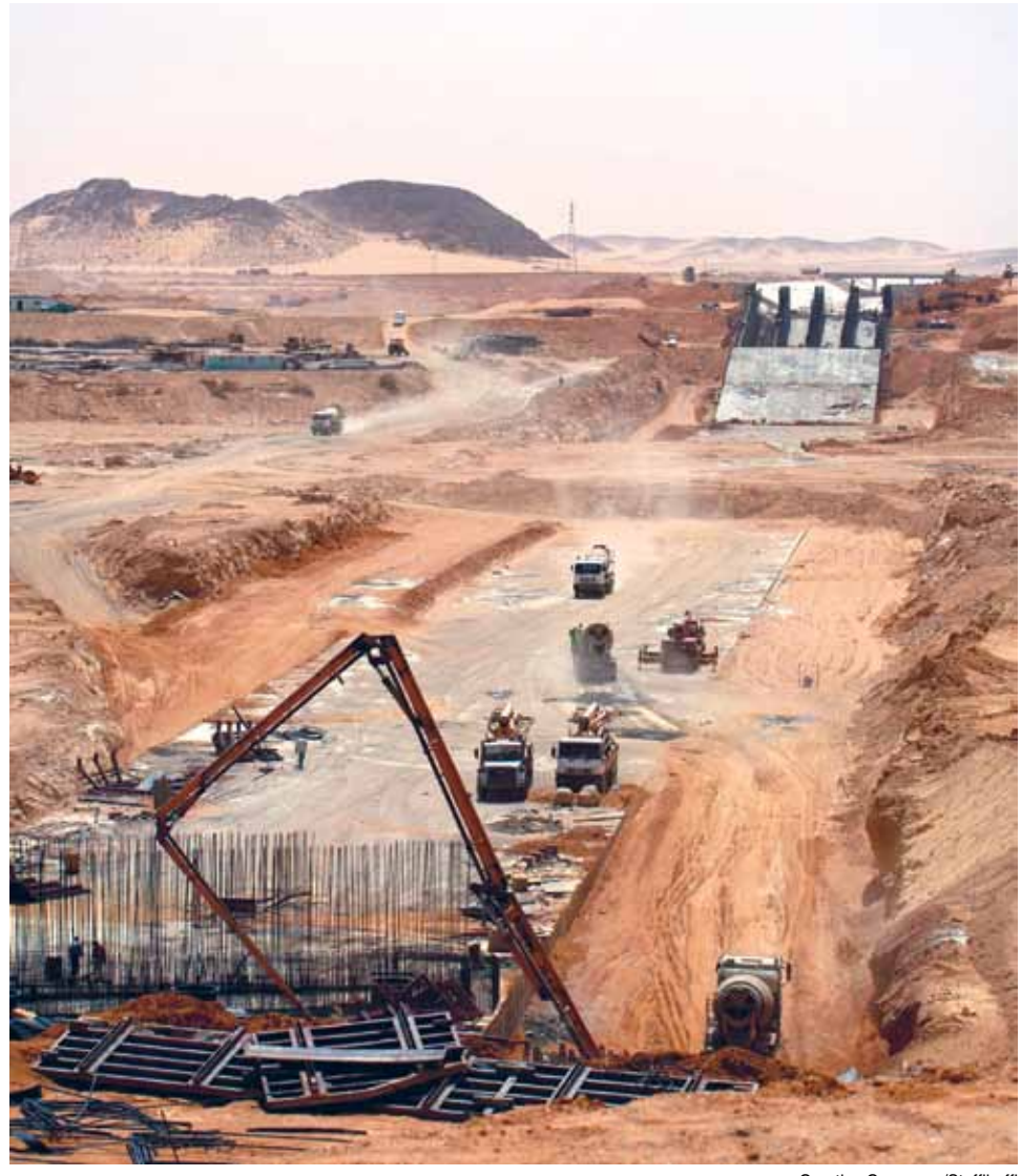
The Toshka Project, showing the construction site (2010) of the syphon that will deliver water to desert areas.

nated in Egyptian pounds, which will be offered in three categories: LE10, LE100 and LE1,000, at a 12% interest rate. They will also be issued in U.S. dollars in multiples of $1,000 at 3% interest. This will involve a coalition of Egyptian banks, private and state-run. These measures are expected to ensure that there will be no replay of 1956, when France and Great Britain, who owned the canal at the time, launched a war against Egypt when Nasser nationalized the Canal, despite the fact that his action was legal under international law.