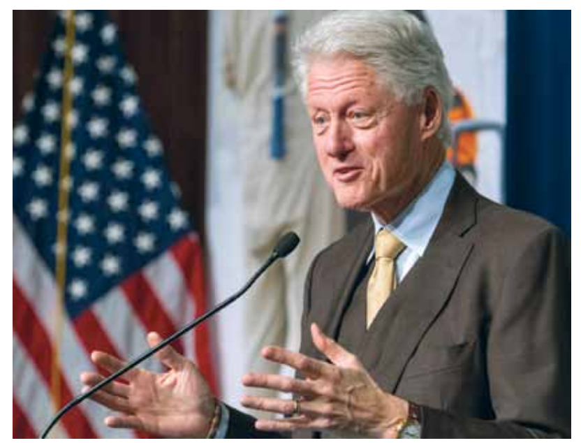
Department of Labor