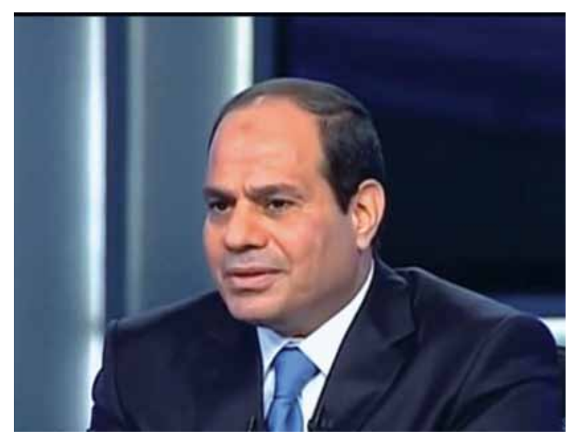
Egyptian President Abdel Fattah al-Sisi has launched an aggressive development program for Egypt, including a New Suez Canal and greening of the Sahara Desert.

The financing for the project is very interesting. It's