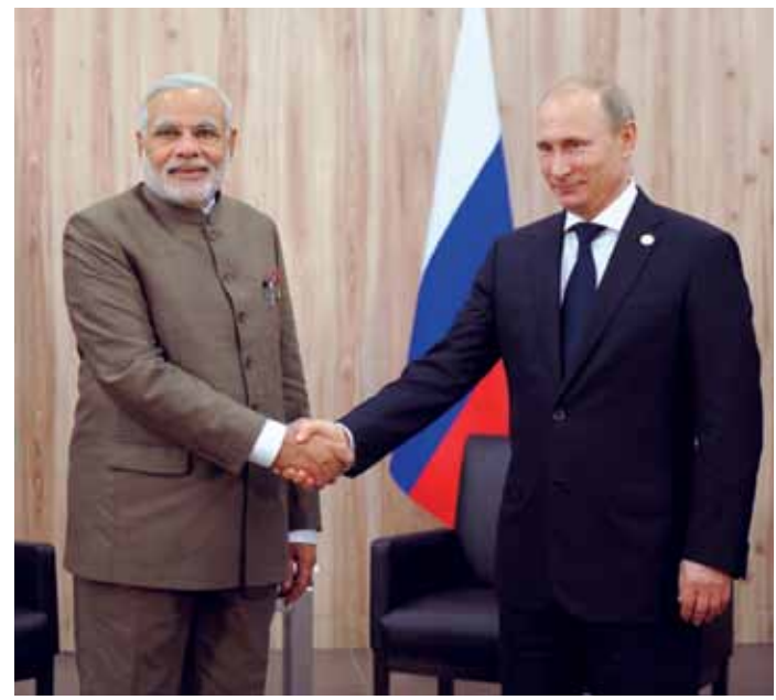
Press Information Bureau of India