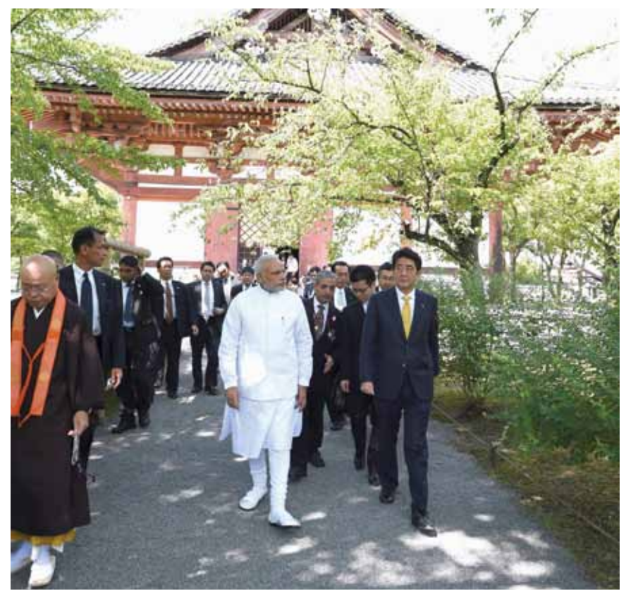
Press Information Bureau of India