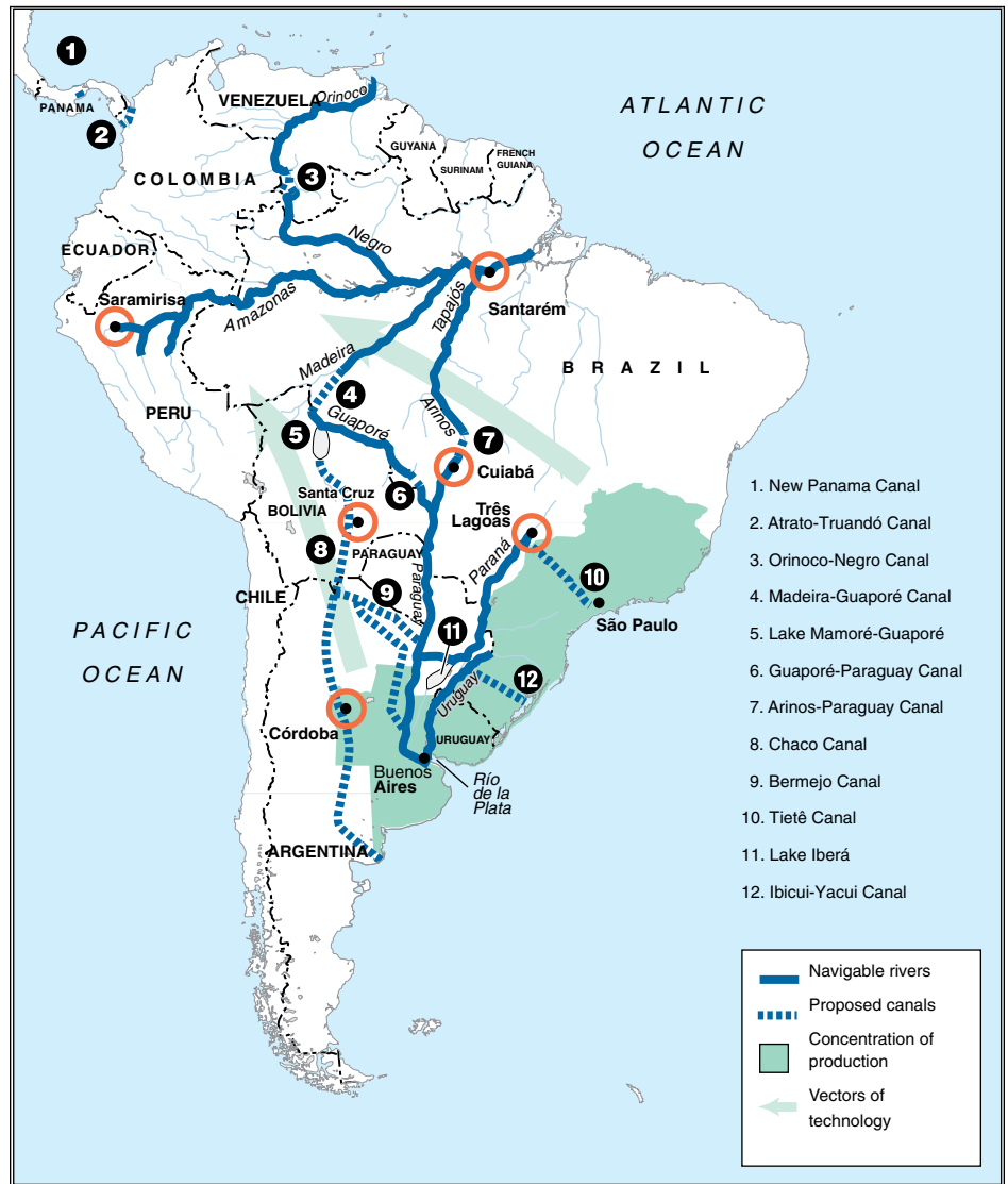
FIGURE 1 South America: Great Water Projects

This is a geographically critical area for all of South America (see maps). The Bolivian government is already building a major inland port at Puerto Busch on the Paraguay River—a town which is currently unpopulated, except for a Navy outpost. This will give landlocked Bolivia access to the Atlantic Ocean via Paraguay and Argentina. Just north of Puerto Busch is Puerto