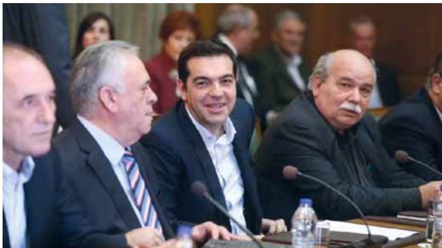
Greek Prime Minister Alexis Tsipras (center), at the first meeting of his Cabinet, Jan. 28, 2015. He surprised the pundits by announcing that his government will stick to its election promises and uphold national sovereignty.

There is a huge change in Europe. Europe is no longer the same as it was a couple of weeks ago, exactly because of the election victory of Syriza and the Independent Greeks, because of what these two parties made their election campaign with: They promised they would end the brutal austerity policy of the Troika, a policy which in the last several years had cut Greek industry by one-third, increased the death rate, the suicide rate, and collapsed the birth rate, and led to youth unemployment rate of 65%! So you can imagine the mood in a country where two-thirds of the young people are unemployed. So on that program, that he would end the policy of the Troika and cancel the Troika’s Memorandum, Alexis Tsipras won an overwhelming victory, not