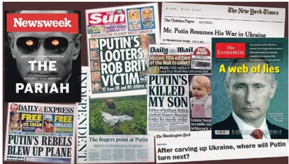
The demonizing of Putin has overwhelmed the “mainstream” American press.

But Putin made a speech at this conference [in 2007], and that should have been a wake-up call for people in the West, because Putin expressed a very deep disappointment, about the United States in particular, and its effort to create a unipolar world. And he pointed to the fact that this was another word for going for an empire, and to the fact that the numbers of wars and local conflicts has increased as a result of that effort. He didn’t go into it, but he could have said: Iraq, Libya, Afghanistan, Syria, and so forth and so on.