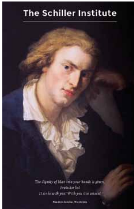
The Schiller Institute's brochure on its history and mission is available in PDF at its website .

This is what elevates us above the power of nature.