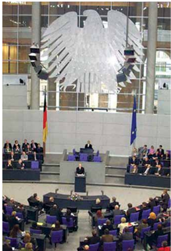
Russian Presidential Press and Information Service

The same thing was also admitted by Horst Teltschik who was, together with Kohl, in these negotiations around German reunification, and he was the former head of the Munich Security Conference. The same thing was just, again, reiterated by former U.S. Ambassador Jack Matlock, who spoke for an organization called the Committee for the Republic, which is an American patriotic organization, fighting to defend and protect the American Constitution. He gave a press conference just three days ago, on Feb. 11 at the National Press Club in Washington, D.C. He was instrumental in ending the Cold War at the time, and he blasted the present administration and the Congress, saying that they have an “autistic” foreign policy, that in the negotiations, he was involved in with [President George H.W.] Bush and Gorbachov in ’89 and ’90, definite promises were made to Gorbachov. There was no written treaty, because it was assumed that what the word was, was valid, so nobody thought it was even necessary to write a formal treaty about it. And that was broken.