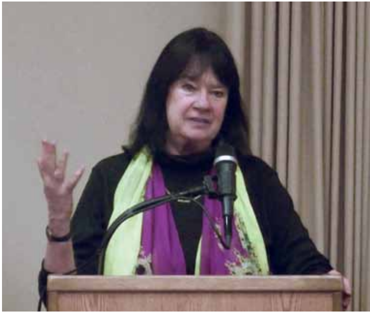
Helga Zepp-LaRouche addresses the conference in New York City, Feb. 14, 2015: “The brainwashing which has been done to the American people and to the European people is unbelievable!”

Now, these were considered “good Nazis” because they were owned by the West; but then, in the evolution of the Maidan in 2014, they made a coup on the 21st of February, and that was recognized by Germany, France, the United States, the British, the EU—they all went along with it, and they all pretended that this Ukrainian government was a legitimate government and that it was okay to work with them.