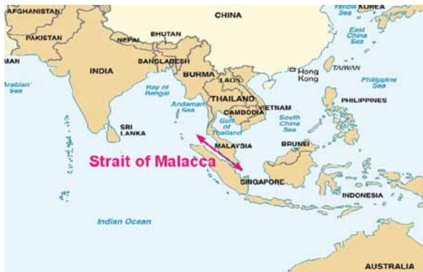
FIGURE 2 The Strait of Malacca

ported are energy products—mainly oil and gas.