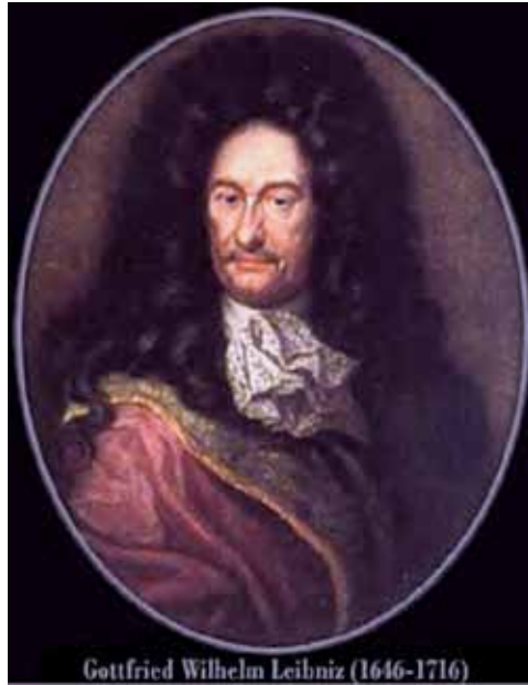
Leibniz conceived a "Land-bridge" from Europe to China in the early Eighteenth Century.

It was in order to change a Europe devastated by irrational wars and hostage to the demons of religious fanaticism, that Leibniz, a contemporary and collaborator of Jean-Baptiste Colbert, fought to create the conditions for peace and development throughout the Eurasian continent.