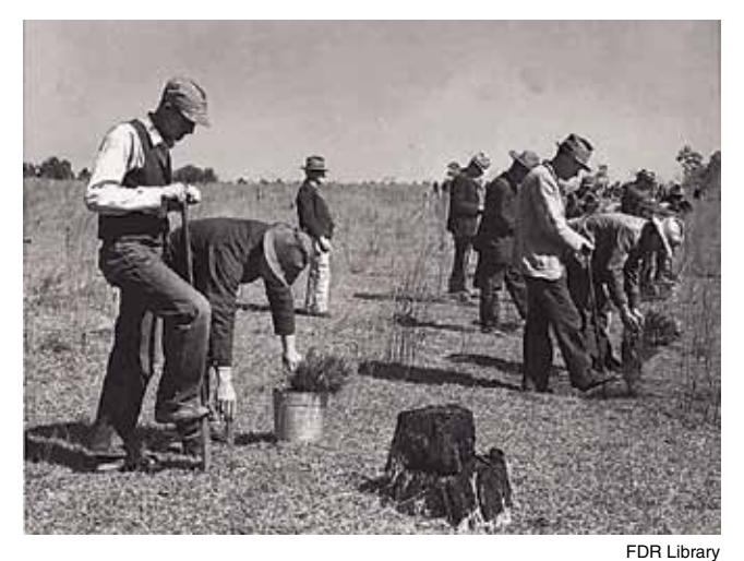
Civilian Conservation Corp workers planting trees in 1933.