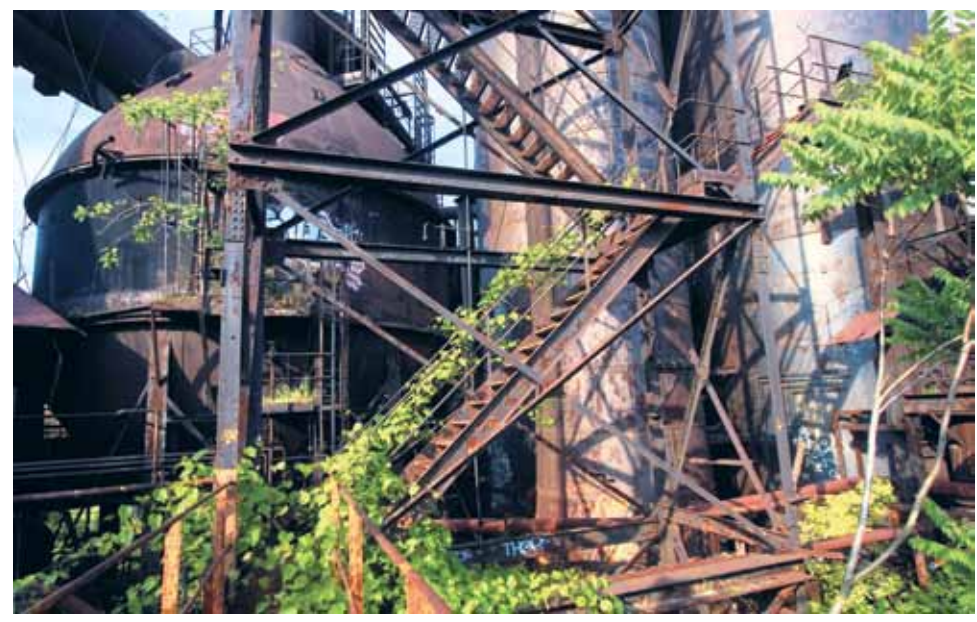
An abandoned blast furnce in Pittsburgh, Pennsylvania.

of the entire manufacturing facility, as it has been today.